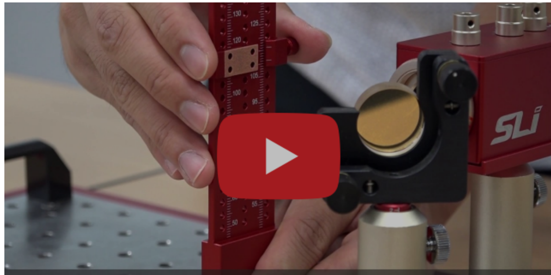
As you can see, when IR slider comes into the path of IR laser beam it can be visualized as an orange spot.