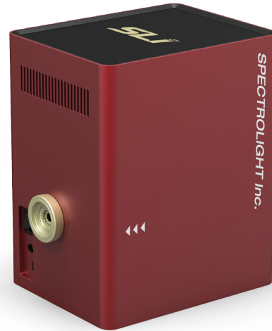
Figure 1. FWS Poly

Traditional tools for wavelength filtering, such as monochromators and filter wheels, all have some type of limitation that often compromises their use in scientific and industrial settings. However, a new type of wavelength filtering device called Flexible Wavelength Selector (FWS) now offers a combination of advantages for both illumination and image filtering. Specifically, FWS devices combine the wavelength tunability and bandwidth control of a monochromator with the circular uniform aperture of a filter wheel. These devices are highly efficient, simple, and cost-effective. In this article, we describe this innovative product and show its application with broadband lamp.