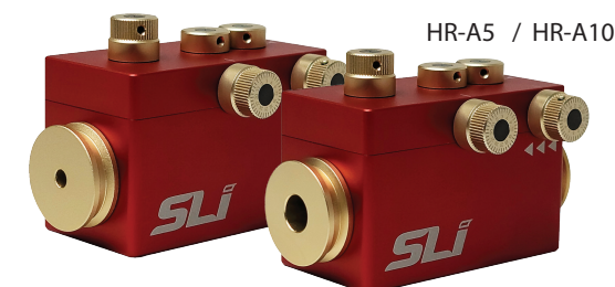
HR-A5 / HR-A10