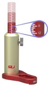
Precision engraved fiducials